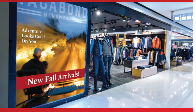
Signage Is an Evergreen Component of Any Successful Business.

Put your signage in the hands of the experts.