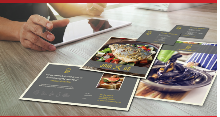
From Simple to Complex Print Projects, We're the Resource You Can Trust to Get It Done Right.

Your one printing resource for everything you need.