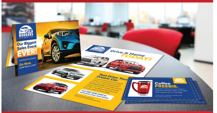
Stand Out with Your Target Audience.

Sir Speedy can develop direct mail campaigns that connect you to meaningful prospects and customers.